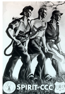
CCC Poster Painted by Harry Rossoll

The trails areas in the MLCT properties are for hiking only. Dogs are allowed, but must be leashed. Please pick up all animal waste. Contact the State Forest HQ for other activities allowed on their sites.